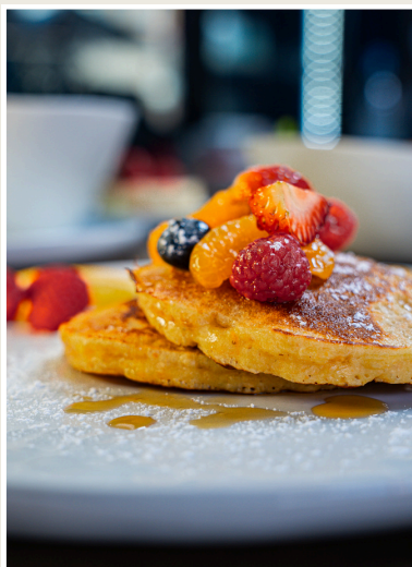
Orange Granola Pancake

EGGS BENEDICT $18 English Muffin, Ham, Spinach, Egg, Hollandaise Sauce